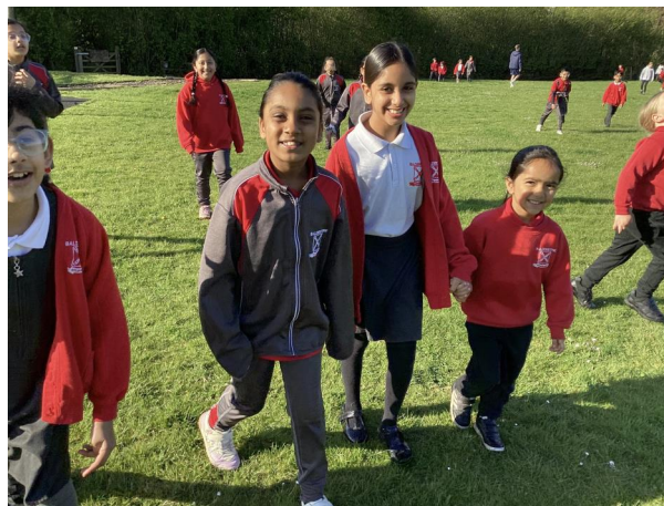
1 - Daily mile at Brekkie club - in the sunshine