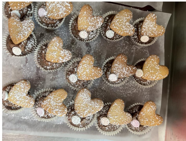
1 - Miss Lee's beautiful Valentine's Day cakes!