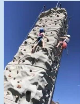
24ft Climbing Wall