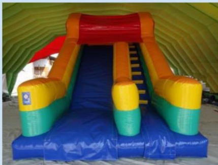
20 ft inflatable slide