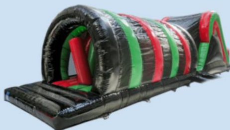
Inflatable Assault Course