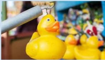
Hook a Duck