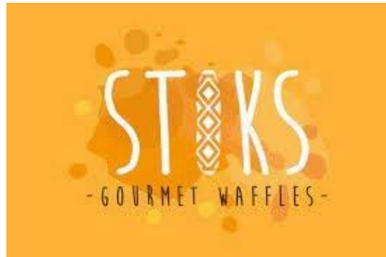
1 - Thank you to Stiks for their ongoing support of school fund-raising.