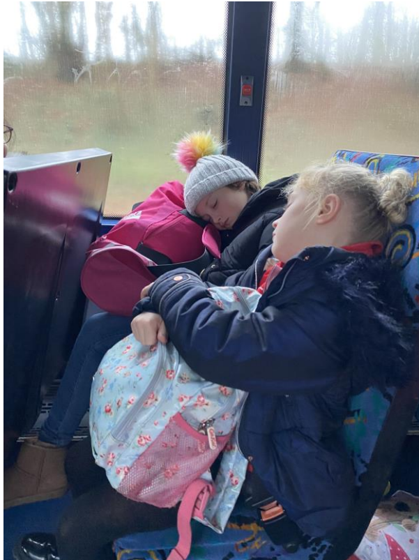
1 - Sleepy heads on the coach back!