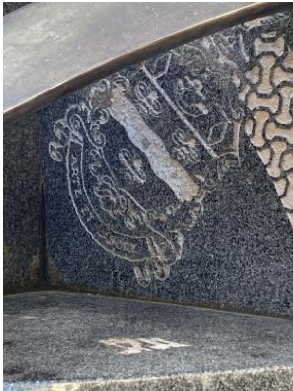
3 - Here is the Blackburn coat of arms.