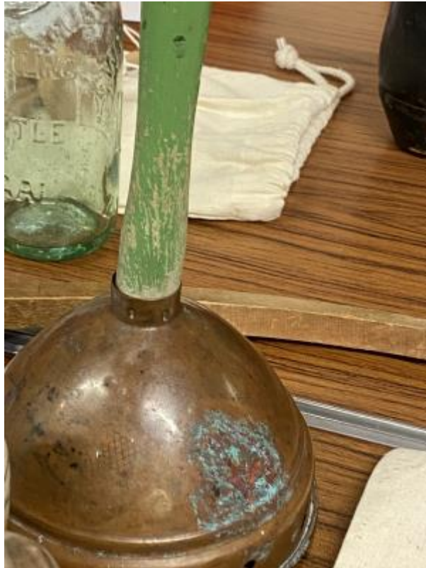
2 - This would help with your washing!