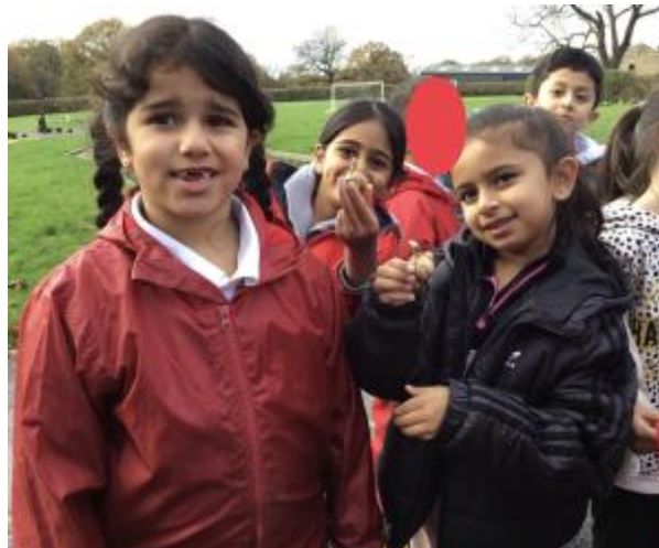
1 - Planting bulbs

Year 2 have been having a great time in Forest School this term. This week it was dry enough for a campfire after digging and planting bulbs!