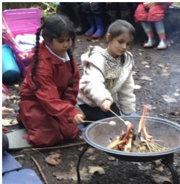
3 - Marshmallows toasted on the campfire