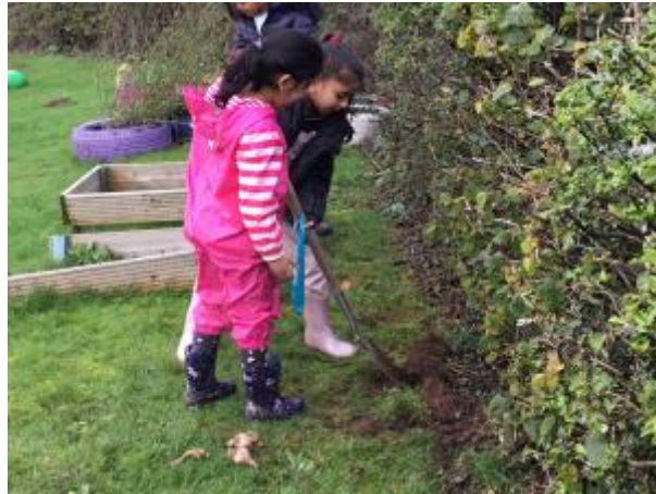
2 - We love digging and finding worms!