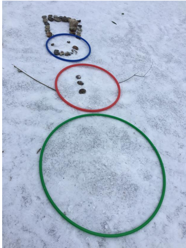
3 - Runner-up