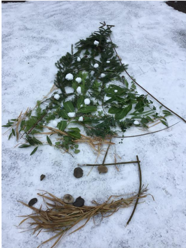
1 - Highly commended