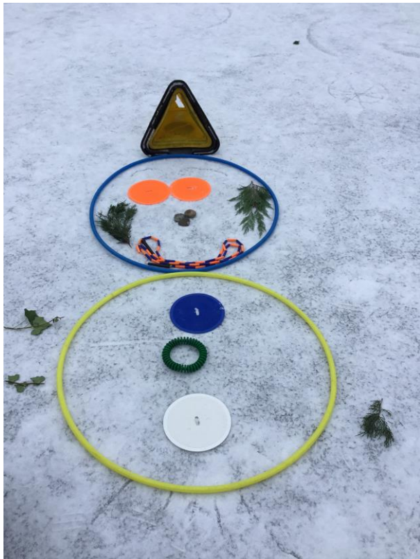
2 - Winning design!