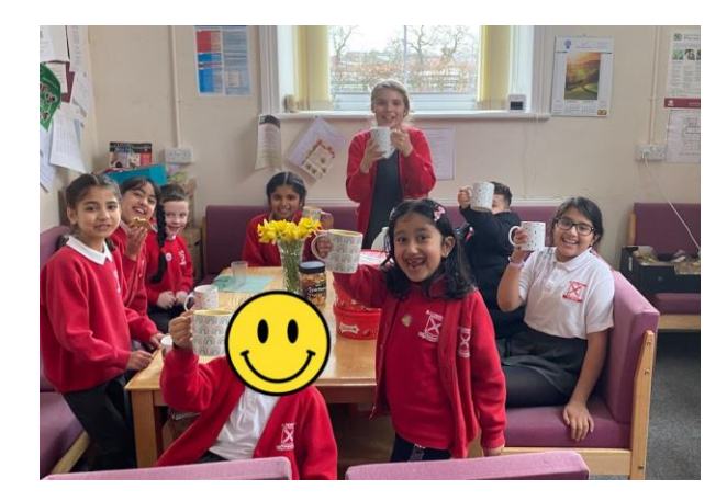
2 - Here we are enjoying our hot choc and treats!