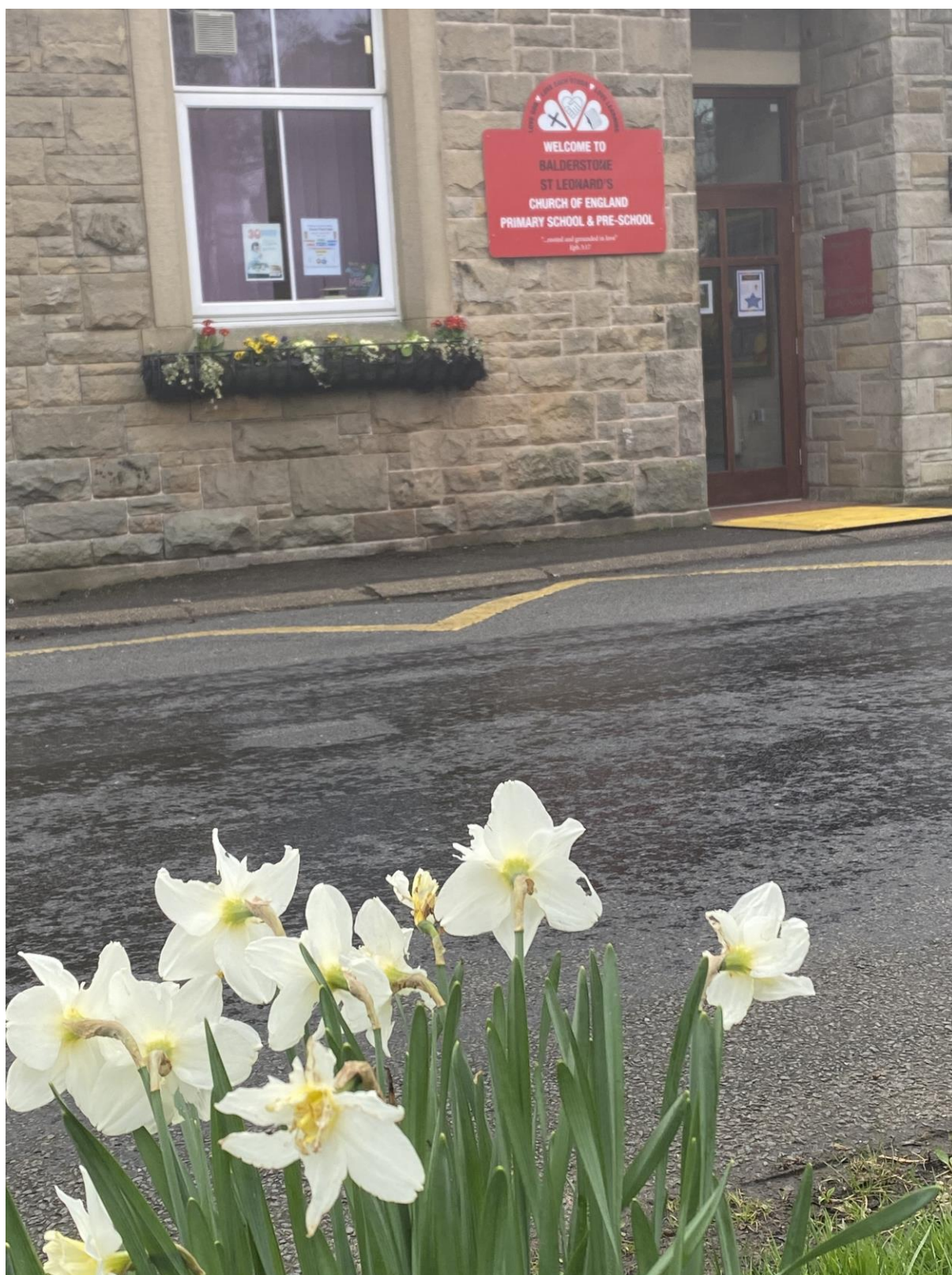
Balderstone St Leonard's CE Primary Newsletter April 21st