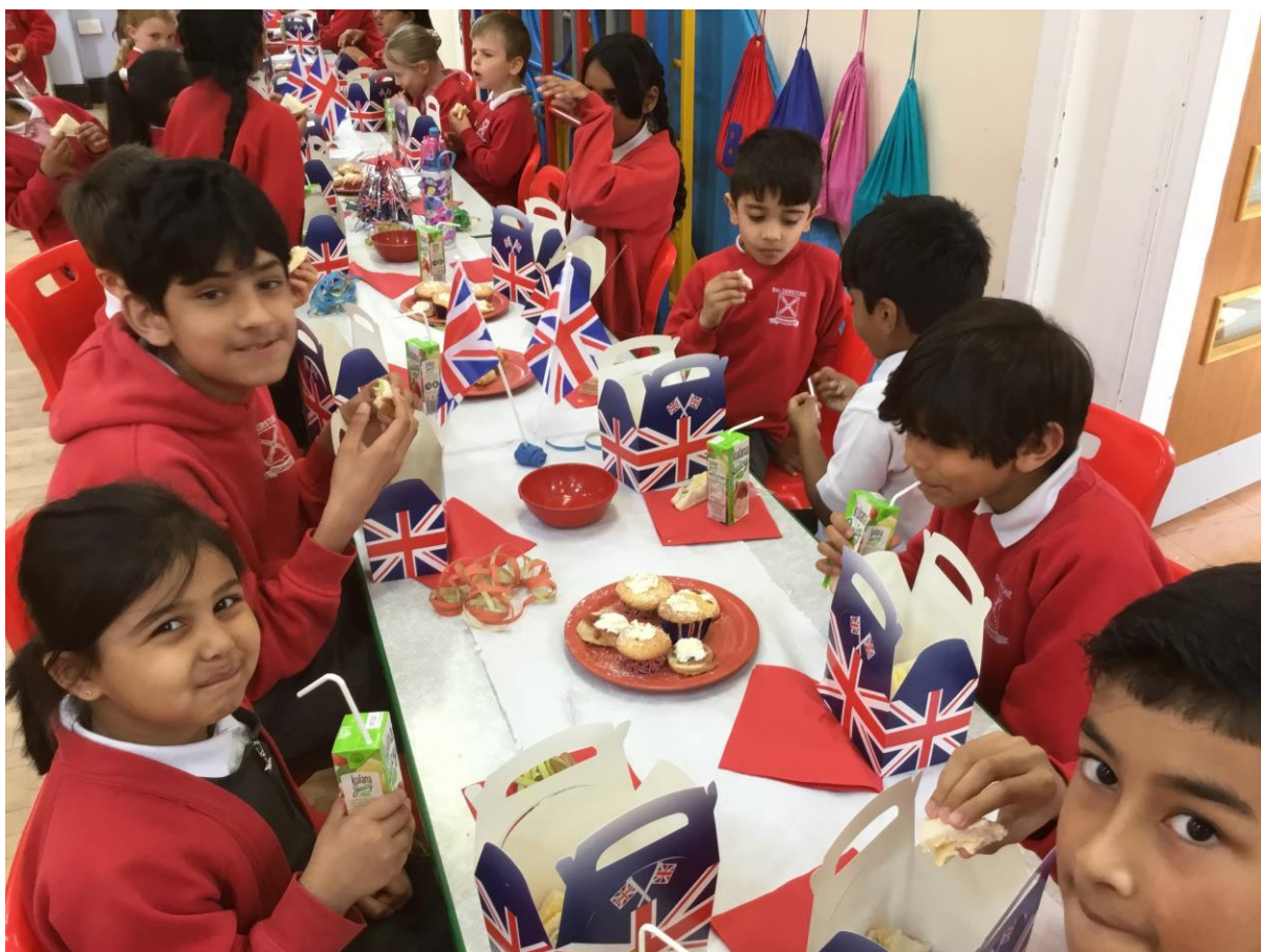
Coronation Community Tea party