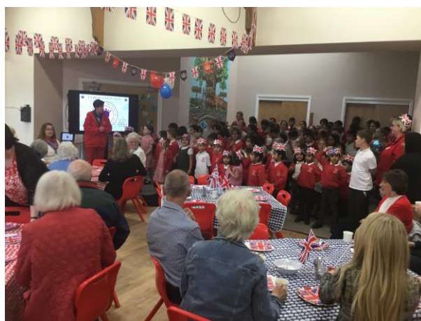
1 - Thank you so much to all our performers!