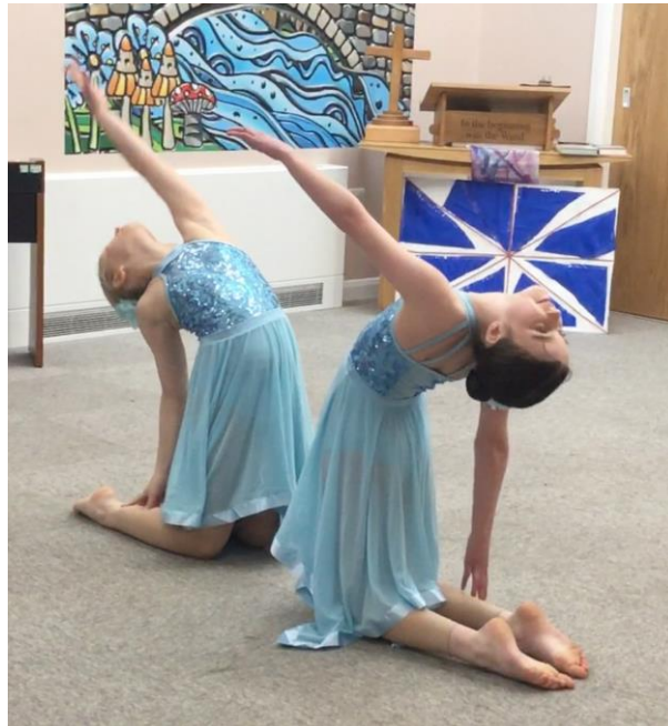
2 - Amazing dancers from Owl class!