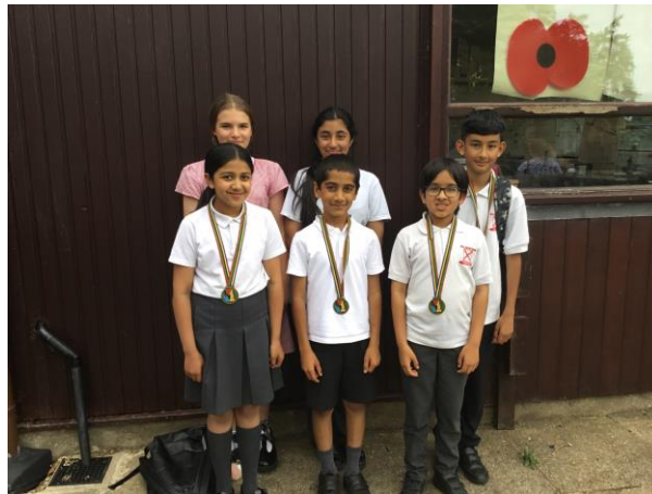
1 - Here are our winning orienteering team!

We are so, so proud to have 2 teams representing the Ribble Valley and Hyndburn area at the Youth Games in Blackpool on 4th July. Our Striking and Fielding team and our medal winning Orienteering team will be travelling to Blackpool to compete with teams from the other winning areas. It's amazing that our little school has 2 teams attending!